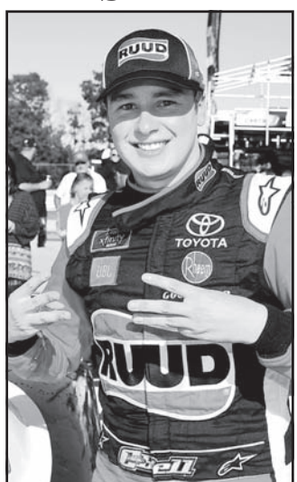
Bell Claims Sixth Xfinity Win

"Yes, I plan on driving still," he said. "My lower back is bruised up real bad. Lots of swelling and I just need that to go down and the pain to chill out. I've been treating the area every day solely